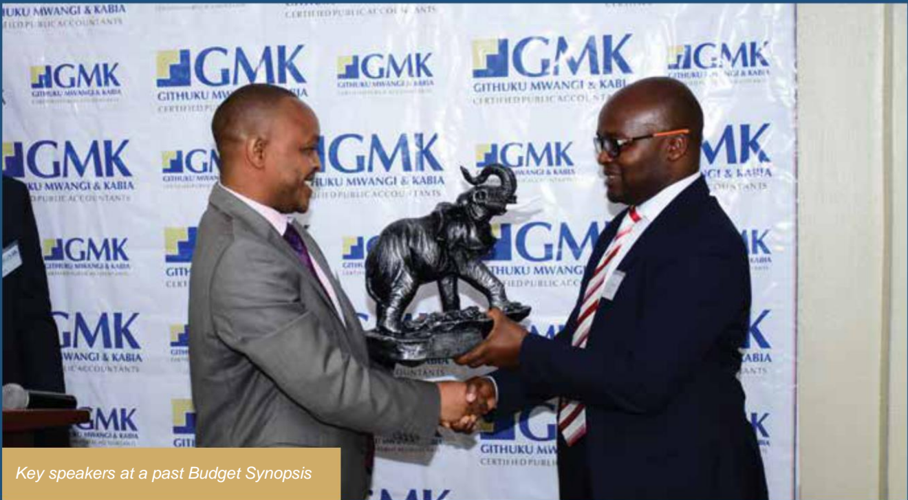
Key speakers at a past Budget Synopsis